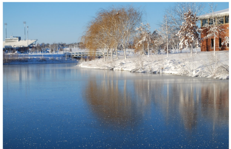
Pictured above: West Des Moines Public Library, the Campus pond, and the Valley High School Stadium.

Another opportunity in 2015 to engage within your community will be the Citizen Survey. Many households in West Des Moines will be asked to rate city services and let us know how we can serve you better. We look for feedback and appreciate all those that take the time to fill out the survey. Citizen input and engagement is always welcome and encouraged. Our website, online service desk, social media, and council meetings are just a few ways ask questions or present ideas. I am looking forward to working together for a bright and productive 2015-Happy New Year!