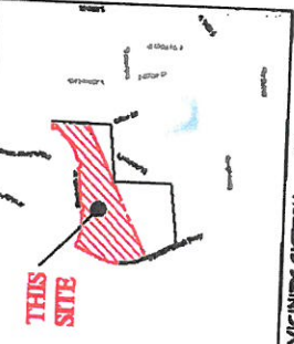
VICINITY SKETCH NO SCALE

NOTES: 1. ALL UTILITIES SHOWN ARE BASED ON RECORD DRAWINGS AND FIELD SURVEY. 2. THE LOCATION OF UTILITIES IS APPROXIMATE AND SHOULD BE VERIFIED BY THE CONTRACTOR. 3. THE CONTRACTOR SHALL BE RESPONSIBLE FOR OBTAINING ALL NECESSARY PERMITS. 4. THE CONTRACTOR SHALL MAINTAIN ACCESS TO ALL ADJACENT PROPERTIES AT ALL TIMES. 5. THE CONTRACTOR SHALL PROTECT ALL EXISTING UTILITIES AND STRUCTURES. 6. THE CONTRACTOR SHALL MAINTAIN ADEQUATE DRAINAGE THROUGHOUT THE PROJECT. 7. THE CONTRACTOR SHALL MAINTAIN ALL EXISTING AND PROPOSED EROSION CONTROL MEASURES. 8. THE CONTRACTOR SHALL MAINTAIN ALL EXISTING AND PROPOSED FLOOD CONTROL MEASURES. 9. THE CONTRACTOR SHALL MAINTAIN ALL EXISTING AND PROPOSED TRAFFIC CONTROL MEASURES. 10. THE CONTRACTOR SHALL MAINTAIN ALL EXISTING AND PROPOSED SAFETY MEASURES.