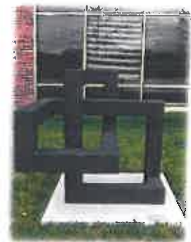
People's Choice Winner 2016 "GEO"

*Decisions by the selection panel are final and not open to negotiation.