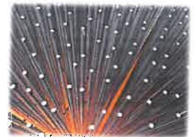
People's Choice Winner 2014 "Frequency"