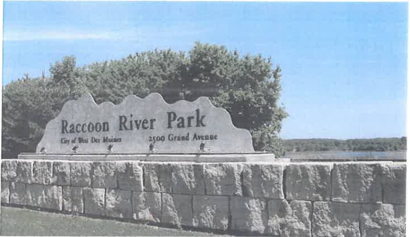
Entrance to Raccoon River Park