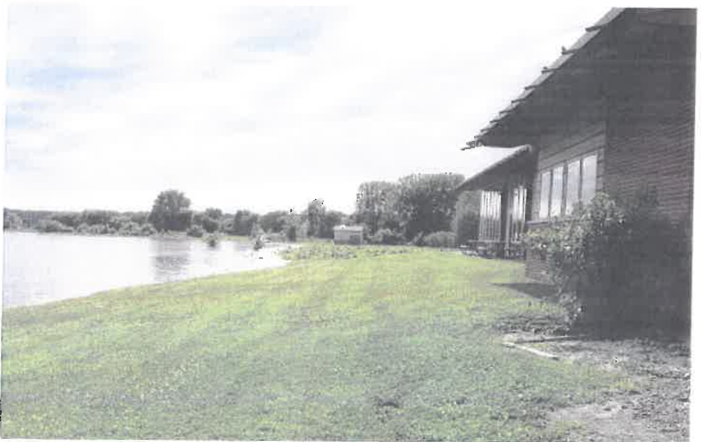
Images of flooding in the park