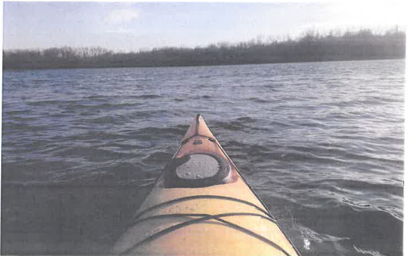
Kayaking on Blue Heron Lake