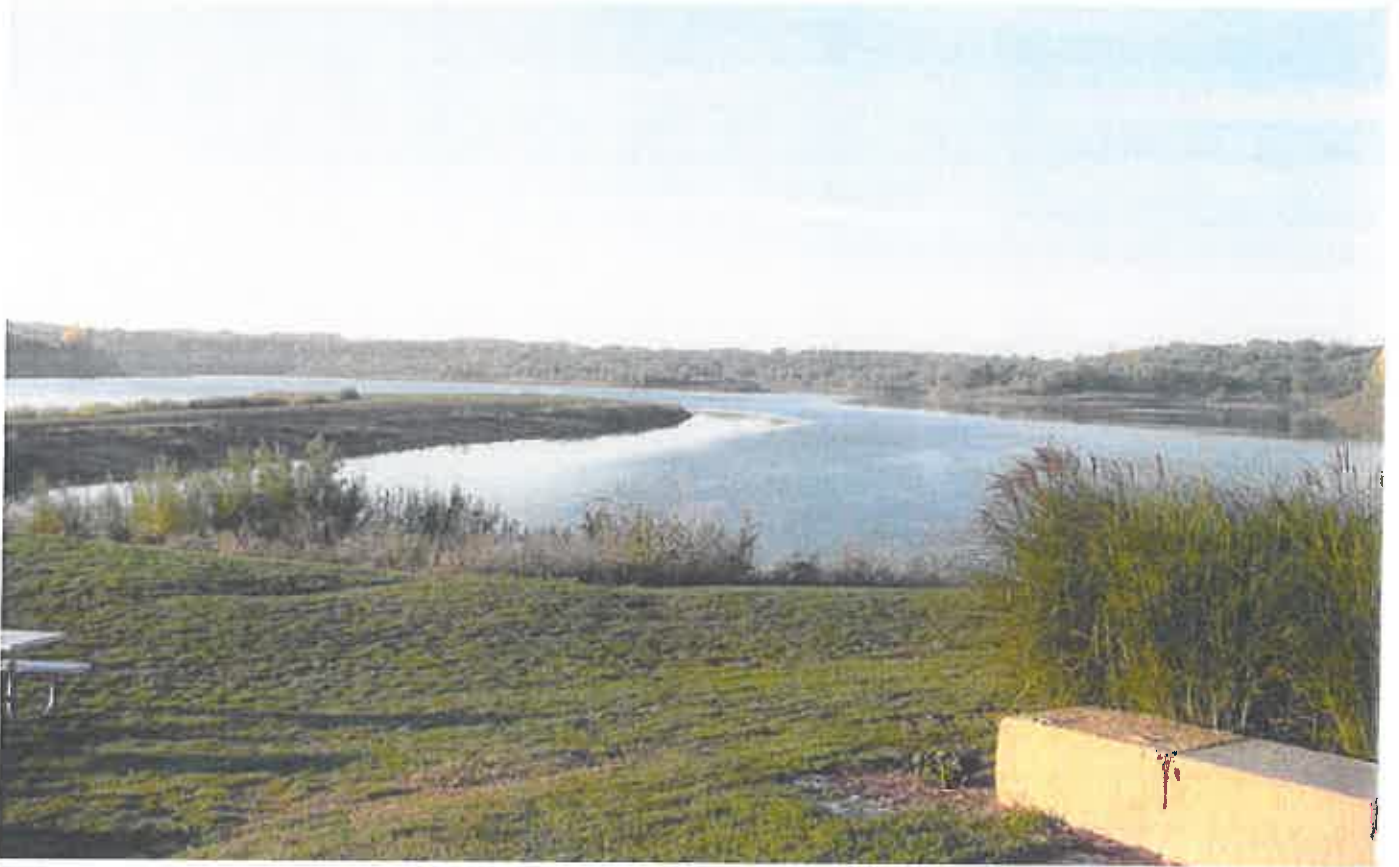
Blue Heron Lake