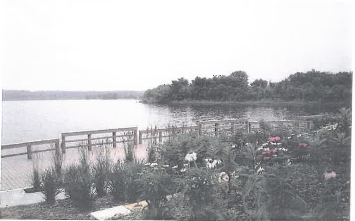
Images of the Fishing Pier