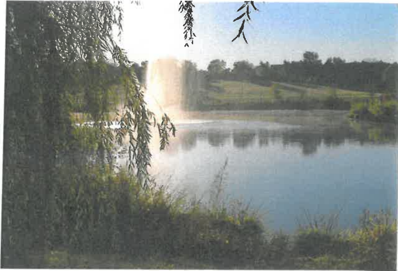
PHOTOS SHOWING THE CHARACTER OF WDM CITY CAMPUS/ IMAGES OF THE JAMIE HURD AMPHITHEATER (currently under construction)