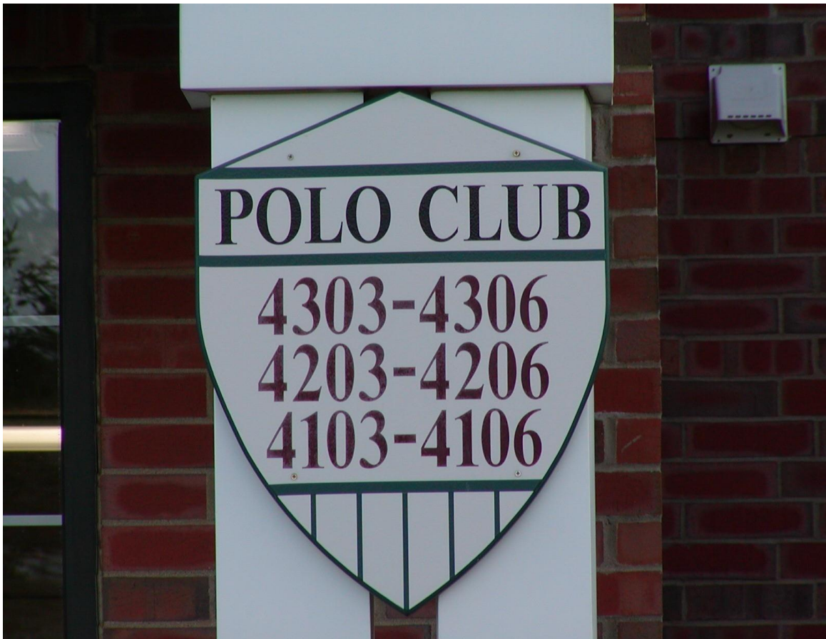
The first number indicates the building number (4000), the second number indicates the floor level (1=first floor, 2=second floor, etc.). The following numbers indicate the apartment number. Minimum 3 inch high, ½ inch stroke.