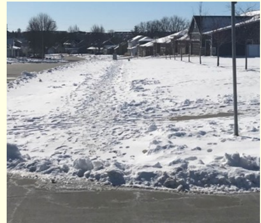
This sidewalk does NOT meet City Code 7-1-5 since it has not been cleared within 24 hours after a storm.

If your sidewalk is icy, please apply sand or applicable deicer product to reduce pedestrian injury and minimize your exposure to liability.